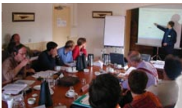
NUSAP expert elicitation workshop, Loosdrecht, June 12 and 13 2001